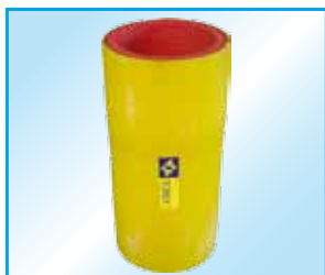
NR Natural Rubber anti-abrasion