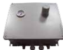
ATEX certified Ex II 3D T135°C Ambient Temperature : -5°C / + 40°C