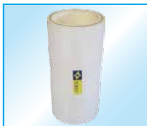
NBR Natural Rubber food grade