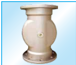
Made from aluminium casting